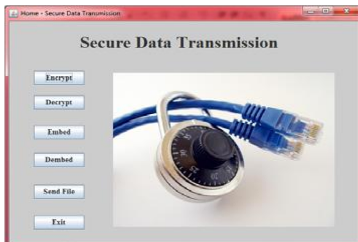
Snapshot 2: Home Window