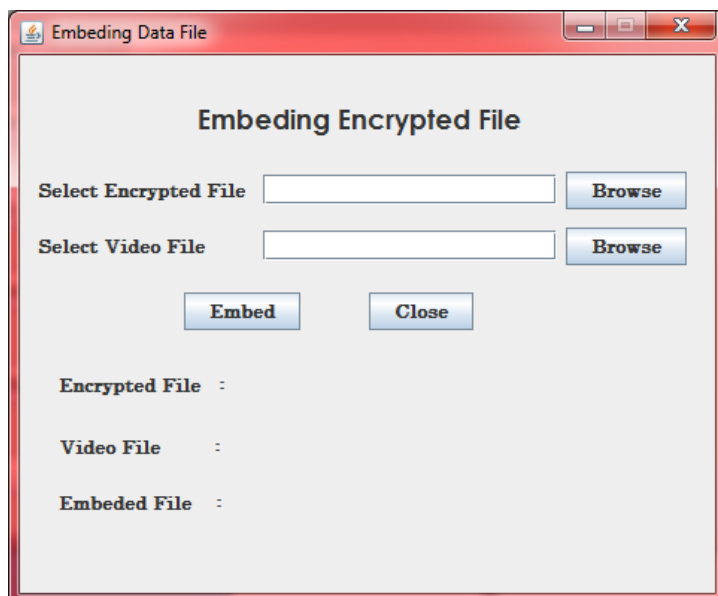
Snapshot 4: Embedding Window