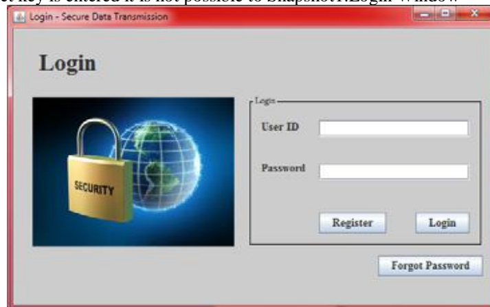
Snapshot1: Login Window

decryption, embedding, and de-embedding. The Encryption window provides option for selecting secret message file, for this system the secret message file is text file. Embedding window to embed the message in cover file to get stegomedium and the press save button to save the stegomedium. In Home window press dembed button in home window to extract the secret message from stegomedium and then press decrypt button to get the original file which is in readable form. And press exit button to get out of the home window. Secret key is required at the time of encryption at sender side and same secret key is required at receiver side to decrypt the dembedded file. Secret key must be known to both sender and receiver. If the incorrect key is entered it is not possible to Snapshot1:Login Window