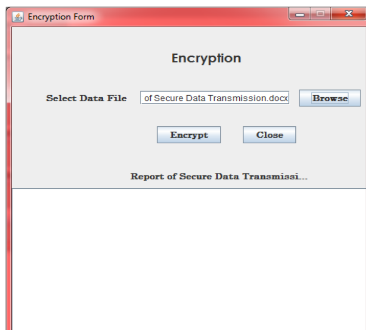
Snapshot 3: Encryption Window