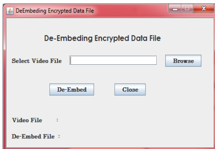
Snapshot 5: De-embedding Encrypted File Window