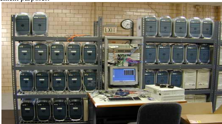
Fig 4: G4 Cluster

The G4 cluster is made of 16 single processor G4 computers each consisting of 16 dual processor G4s and 512 MB RAM, with 1 GB RAM. Each G4 runs a Black Lab Linux and is connected with Myrinet for communications and via Fast Ethernet for management purposes.