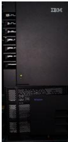
Fig3: IBM Cluster

The IBM cluster is currently consisting of 22 dual-processor IBM RS/6000 43P-260 workstations and 2 quad-processor 44P-270 workstations, for 52 processors in total.