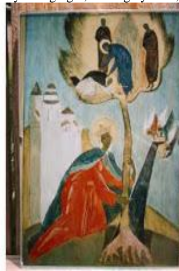
Fig.3 Embedded Image

Left hand side image is the original cover image, whereas right hand side does embedding a text file into the cover image make the stego image. LSB is one of the most popular technique which is used for hiding the secret message. LSB hiding technique works as it hides the secret message directly in the least two significant bits in the image pixels, which affects the image resolution, due to this it reduces the image quality and make the image easy to attack. This method works quite well when both the host and secret images are given equal numbers of bits. When one has significantly more room than another, quality is sacrificed.