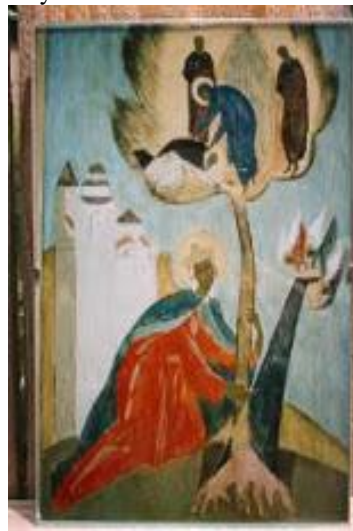
Fig.2 Original Image

Note that we have successfully hidden 9 bits but at a cost of only changing 4, or roughly 50%, of the LSBs.