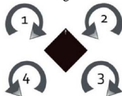
Fig - 'X' config.

In 'x' config. is almost same to '+' configuration. Only difference is QC operating motherboard front will be point to the direction between rotor-1 and rotot-2 shown in fig.