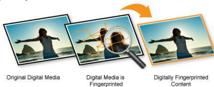
Figure 3 Applications in Digital Fingerprinting

E. Tamper Detection:- Digital content can be detected for tampering by embedding fragile watermarks. If the fragile watermark is destroyed or degraded, it indicated the presence of tampering and hence the digital content cannot be trusted. Tamper detection is very important for some applications that involve highly sensitive data like satellite imagery or medical imagery. Tamper detection is also useful in court of law where digital images could be used as a forensic tool to prove whether the image is tampered or not.