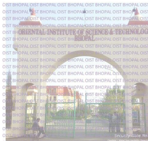
Figure 2 Applications in Contents Archiving

B. Content Archiving: -Watermarking can be used to insert digital object identifier or serial number to help archive digital contents like images, audio or video. It can also be used for classifying and organizing digital contents. Normally digital contents are identified by their file names; however, this is a technique as file names can be easily changed. Hence embedding the object identifier within the object itself reduces the possibility of tampering and hence can be effectively used in archiving systems.