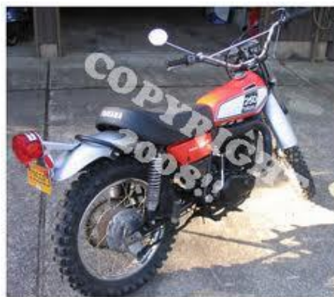
Figure 1 Applications in Copyright

The main applications of digital watermarking are presented as: A. Copyright Protection: Watermarking can be used to protecting redistribution of copyrighted material over the untrusted network like Internet or peer-to-peer (P2P) networks. Content aware networks (p2p) could incorporate watermarking technologies to report or filter out copyrighted material from such networks.