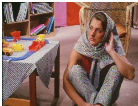
Fig.4 sorted switching median filtered image

Figure 4 has shown that the noise has been reduced using the sorted switching median filter but results are not much effective.