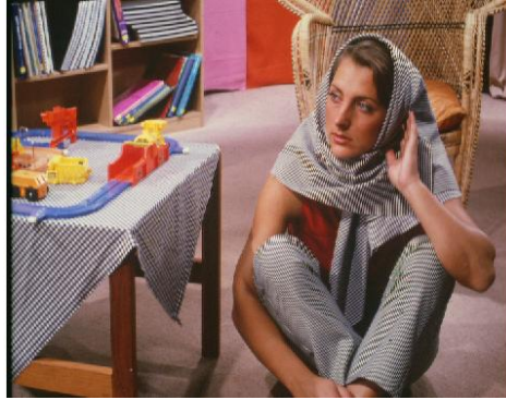
Fig.1 Input image

Figure 1 has shown the input image which is passed to the model.