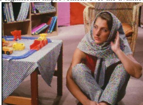
Fig.5 Proposed algorithm's filtered image

Figure 5 has shown that the results are quite effective and has much more better results than the available methods. Thus the proposed algorithm has shown quite significant improvement over the available methods.