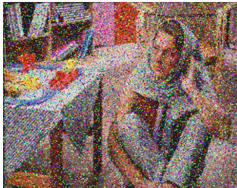
Fig.3 Median filtered image

Figure 3 has shown the filtered image using the traditional median filtered image. It is clearly shown that the image is somehow filtered but has not shown the accurate results.