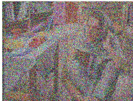
Fig.2 Noisy image

Figure 2 has shown the noisy image with density = 8. It is clearly shown that the noise has degraded the visibility of the image.