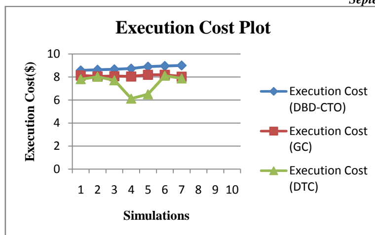
Figure 2: Graph of Execution Cost