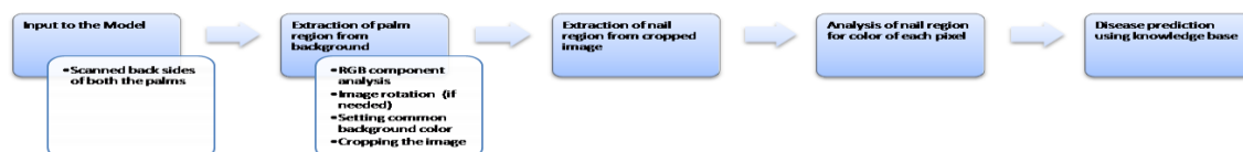
Fig. 1 Model for disease prediction based on digital image processing and medical palmistry

To automate the manual process of analysis of nail color, a model is developed as shown in fig. 1.