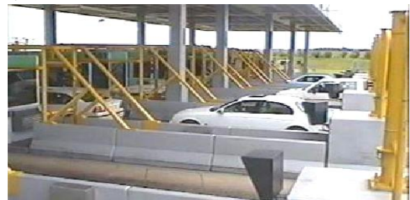
Fig. 1.1: Car at the toll booths

recognize the license number monitored by a camera. Basically, using human to recognize vehicle license number in this way may solve the problems. But using people to do the recognition takes time and needs many workers to do this work.