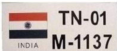
Fig. 1.5: Another Valid License plate format

Few types of variations found in Indian number plates have been shown in the fig. 1.6 [4]. There are a number of algorithms proposed for number plate localization such as multiple interlacing and transform domain filtering. In case of multiple interlacing algorithm [5], horizontal edge detection and vertical edge detection is performed separately on input vehicle image. Then horizontal and vertical edge detected images are added to get an image which avails co-ordinates of