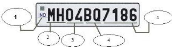
Fig. 1.4:Format of Indian License Plate

Indian number plates can have single row or double row as shown below: