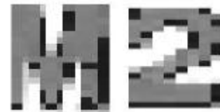
Fig. 3.1: Sample output of Image Scissoring.

The next step after the identification of the rectangular plate is to isolate its characters or digit contents. Various methods like blob coloring [7], peak-to-valley method [8] are suggested for character segmentation. However, these methods are not suitable for Indian number plates since they do not provide good results in cases where the characters are overlapping and are also time consuming. To have reliability and time-optimization, a new „Image Scissoring“ algorithm is developed. In this algorithm, the number plate is vertically scanned and scissored at the row on which there is no white pixel (i.e., a blank row) and the scissored area is copied into new matrix. This scanning procedure proceeds further in search of a blank row and thus different scissored areas are obtained in different matrices. Indian number plates can have either single or double rows. Hence, maximum two matrices must co-exist. To discard false matrices, heights of the matrices are compared. If the height of any of matrix is less than 1/4th of the height of tallest matrix, then the prior matrix is discarded. The same procedure is repeated horizontally on each matrix and using width as a threshold, individual characters are segmented (Fig. 3.1) [1].