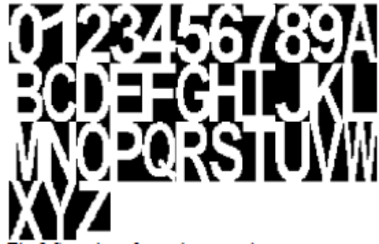
Fig. 5.1: Samples of templates used.

When a number plate region is extracted, the vertical and horizontal histogram projection methods are applied for character segmentation. The number plate is segmented and the images containing individual characters (digits and letters) forming the number plate are obtained. Each image of a character is normalized into size of 20x36. Then the support vectors are calculated directly from the normalized sub-images. The high dimensional feature vectors are stored into two kinds of database, one is for digital numbers, and the other is for letters (Figure 5.1). The above feature vectors are used to train SVMs with RBF kernel. 720 dimensional feature vectors are input into SVMs which have been trained successfully. Then, which character a given candidate should be can be obtained in according to the outputs of SVMs. When all digits and letters on a number plate are recognized (or classified), the recognition of the number plate is complete [9].