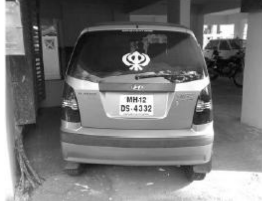
Fig. 1.6: Example of Indian number plate—with unwanted drawing and text

number plate. This approach cannot be employed for Indian number plates because they do not necessarily have a border which mandatory for this algorithm. Transform domain filtering is another approach in which high frequency area of input image is taken out as number plate. This algorithm is also not suitable for Indian conditions because of the presence of other characters or character like structures in input image [6].