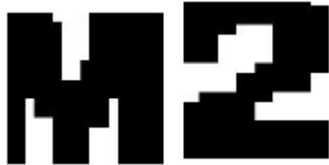
Fig. 4.1: Sample output after character enhancement.

Before going to character recognition step. You have to enhance the characters which are getting from character segmentation. Segmented characters are extracted from input grayscale image. Then each character is adaptively binarized using Ostu's method. After that, the binary character is scissored centered. These steps help to optimize the further recognition process (Fig. 4.1) [1].