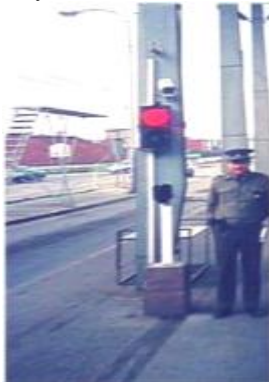
Figure 1.3: Installed LPR system at border crossing.

Hence, we want to develop a system for the vehicle identification to help a human operator and improve the service or work quality [3].