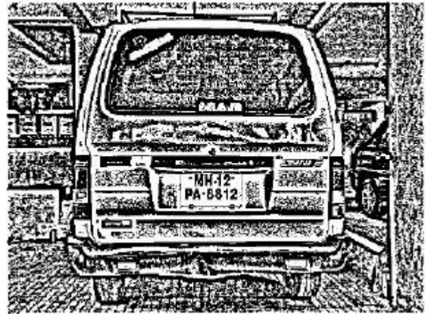
Fig. 2.2: Output of Niblack's algorithm