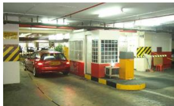
Fig. 1.2: Car inside a parking area