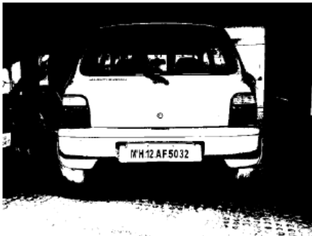
Fig. 2.1: Output of Otsu's algorithm

To eliminate the effect of shadows and to eliminate the low contrast area of an image, binarization has to be performed adaptively. Some approaches like Otsu's algorithm and Niblack's algorithm were tested [6]. The corresponding results are shown in fig. 2.1 and 2.2 respectively. After testing on many images, it is observed that, Niblack's algorithm provided robust thresholding in the presence of shadows and other image defects [7]. It also provide better result as compare to Otsu's algorithm, But it takes more processing time as compare to Otsu's algorithm. Also, Otsu's method, being globally adaptive, provides satisfactory results for a wide variation in selected for binarization [6].